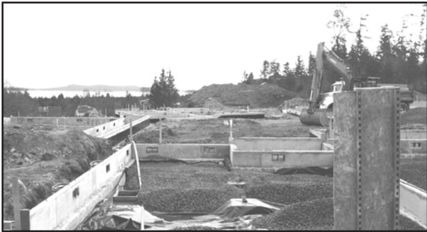
Future homeowner Stacie Milam captured the view over the foundations in January, 2010.

According to the US Department of Energy, “On average, if